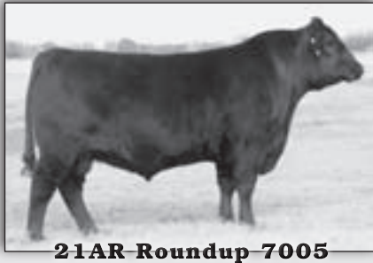
Selling a full sib pregnancy to Roundup and a maternal sister pregnancy by Bismarck. Heavy service represented in this offering!

Both Sales will be broadcast live via the internet <u>only</u> on www.NorthernLivestockVideo.com Please call ahead for your buyer number 1-866-616-5035