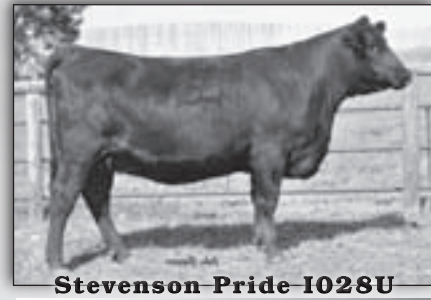
Birth Wean Milk Yrlg Marb RE $B I+2.3 I+62 I+32 I+110 +.17 +.10 40.10