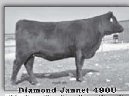
Milk Yrlg +22 +96 Marb RE $B +.42 +.25 45.66 +2.1 +50