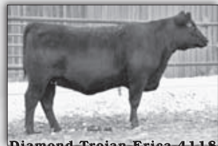
Diamond Trojan Erica 4118 Birth Wean Milk Yrlg Marb RE $B +2.3 +51 +21 +101 +.43 +.17 48.41

Both Sales will be broadcast live via the internet <u>only</u> on www.NorthernLivestockVideo.com Please call ahead for your buyer number 1-866-616-5035