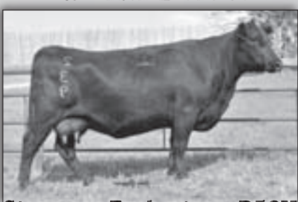
Birth Wean Milk Yrlg Marb +1.0 +51 +22 +81 +.59 + +.28 50.82

Featuring the Maternal Sister to Stevenson Brund 561G