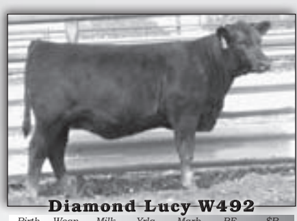
Birth Wean Milk Yrlg Marb RE $B +0.7 +61 +34 +107 +.64 +.46 63.49