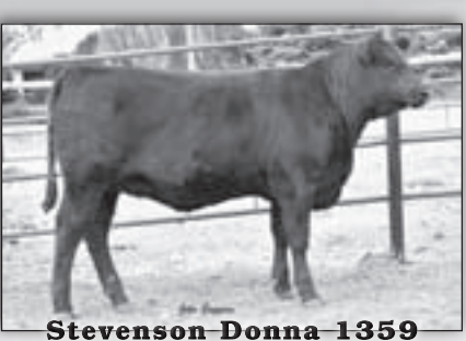
Birth Wean Milk Yrlg Marb RE $B I+1.7 I+56 I+25 I+96 I+.46 I+.12 49.76