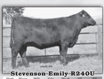
Birth Wean Milk Yrlg Marb RE $B +2.0 +57 +28 +107 +.59 +.22 55.68