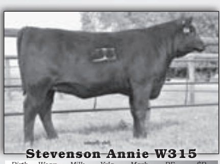
Birth Wean Milk Yrlg Marb RE $B I+0.7 I+53 I+28 I+93 I+.33 I+.22 47.62