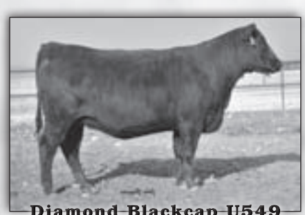
Diamond Blackcap U549 Birth Wean Milk Yrlg -1.0 +55 +27 +98 +.44 +.26 47.82