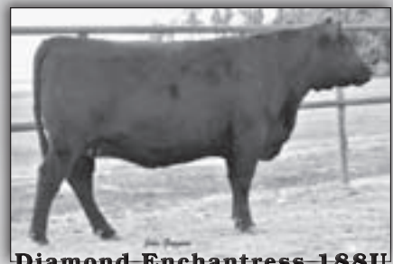
Diamond Enchantress 188U Birth Wean Milk -0.7 +46 +29 Milk +.80 +.16 53.52 +91