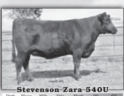
Birth Wean Milk Yrlg Marb RE +1.9 +48 +22 +96 +.54 +.13 +.54 +.13 48.27